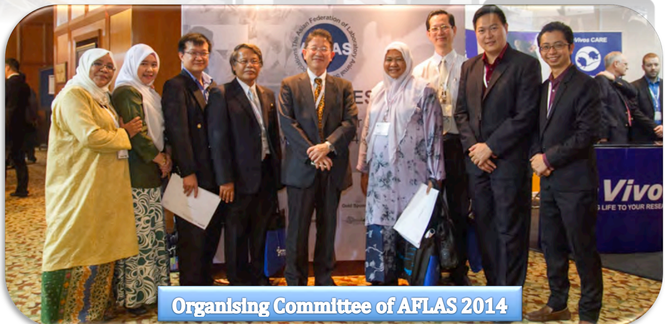
Organising Committee of AFLAS 2014